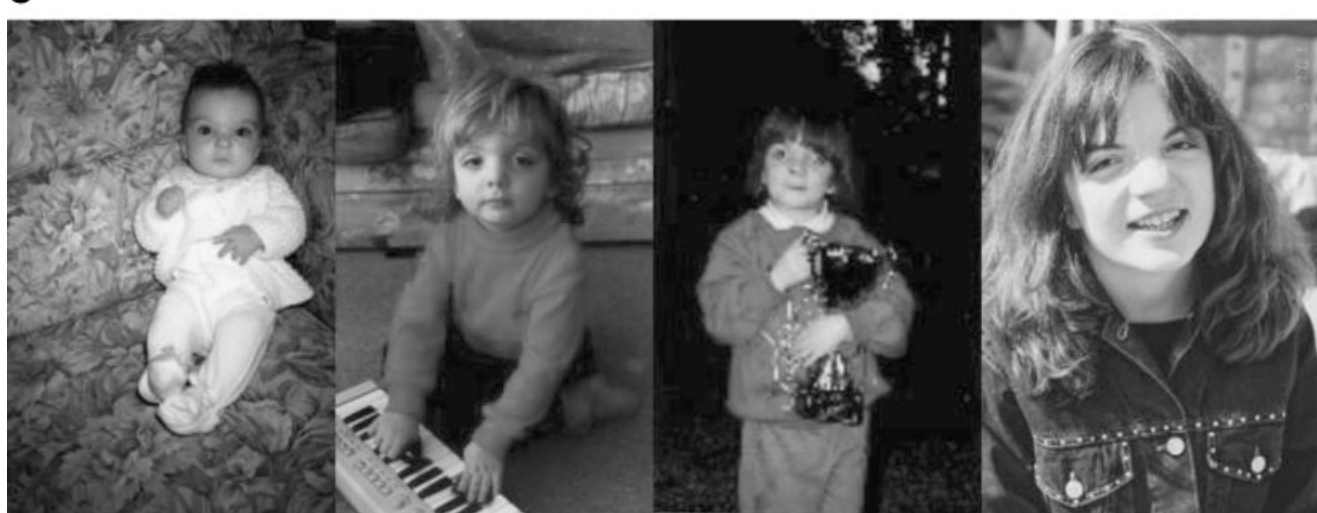
\label{eq:stars} Fig. 1. Serial photographs of three patients with the 11q terminal deletion disorder. A: Ages 3 months, 2 years, 4 years, and 10 years; (B) ages 5 weeks, 7 months, 5 years, and 5 years; (C): ages 9 months, 2 years, 6 years, and 14 years.